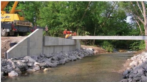
Prestressed beams are set on the south abutment above the precast abutment system.